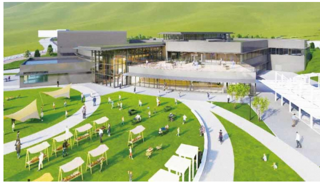
Community Center for recreation, learning and well-being in Kuroiso area ※Estimated Completion in 2025 / Reiwa 7