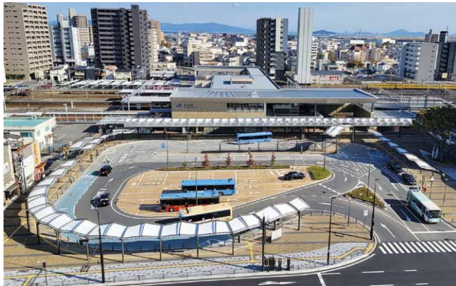
Iwakuni Station Improvement project for the station square and the station passage ※Completed in 2020 / Reiwa 2