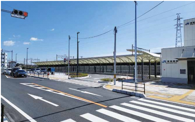
Minami-Iwakuni Station Development project for the station square and the bicycle parking lots ※Completed in 2024 / Reiwa 6