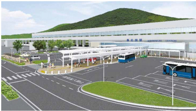
Shin-Iwakuni Station Improvement project for the station square ※Estimated Completion in 2025 / Reiwa 7